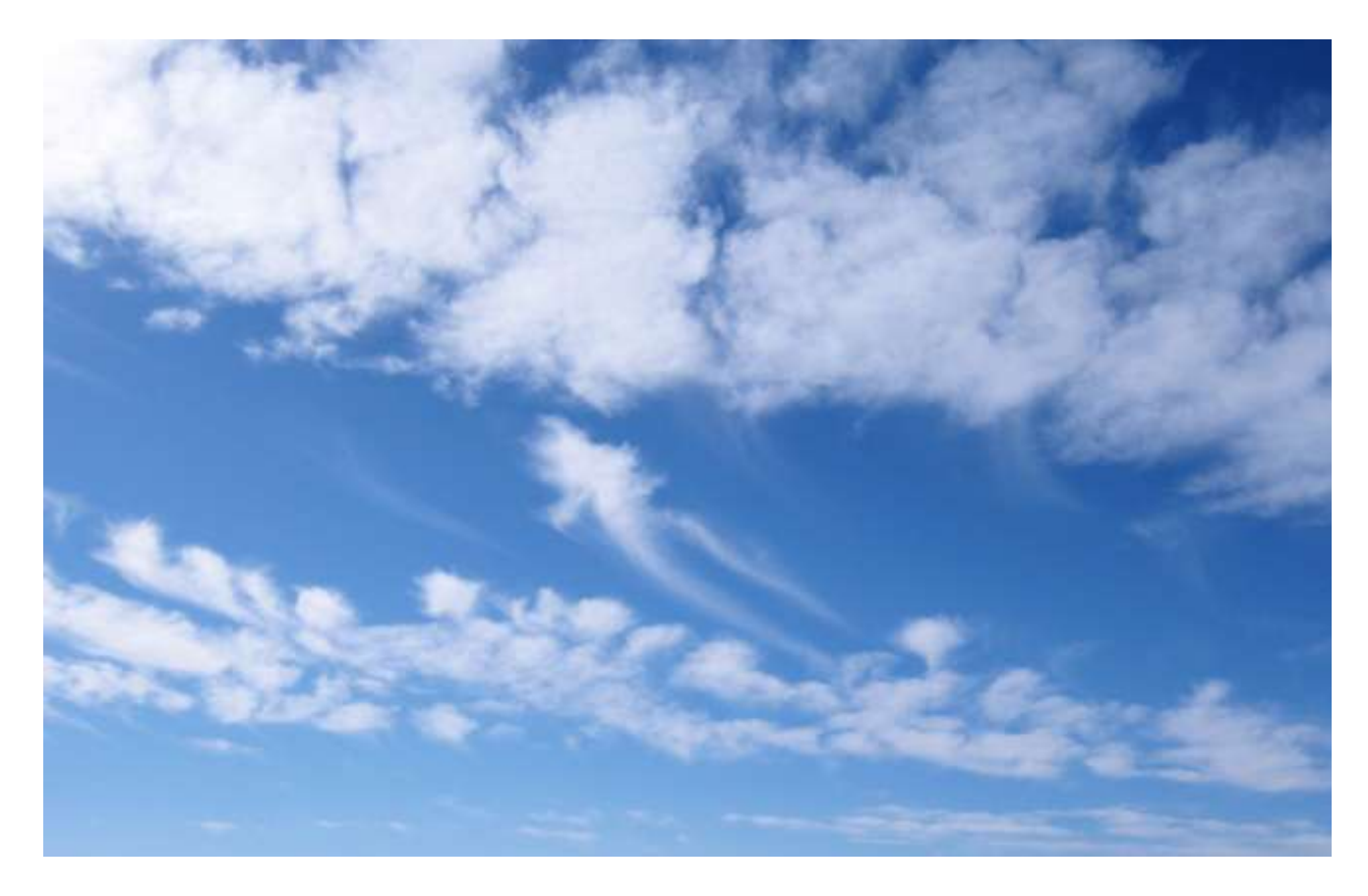
Figure 4 - Final Image