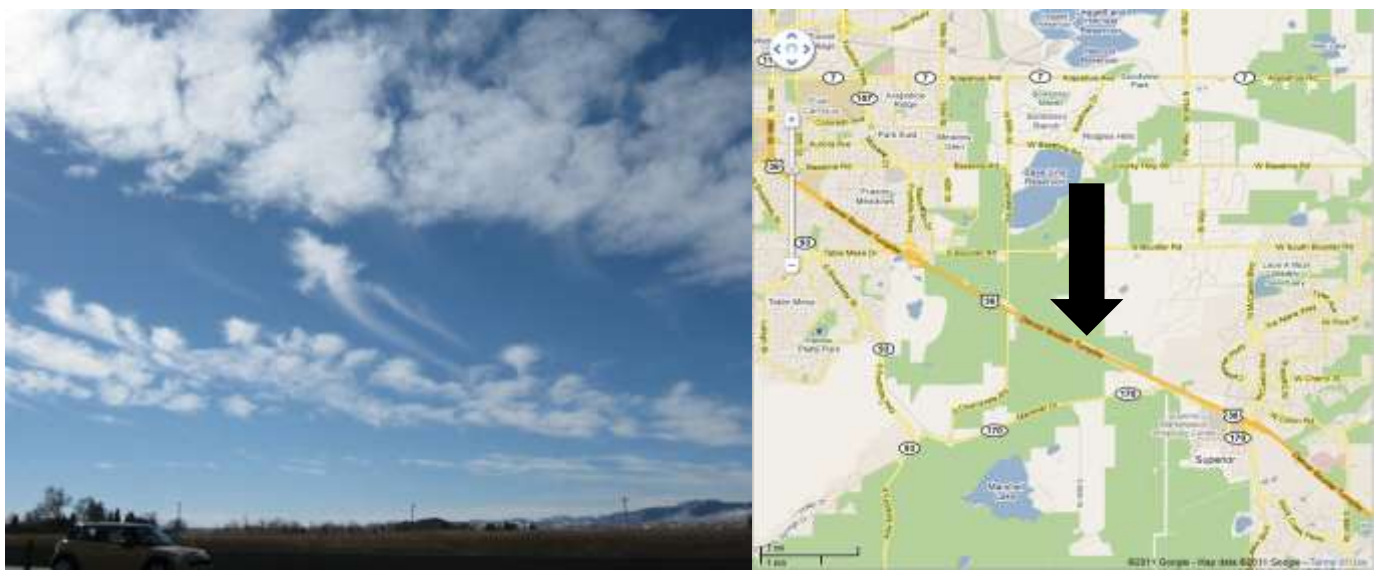
Figure 1 - Original Photograph

The purpose of this image was to capture and analyze a cloud formation that was interesting. Clouds are visible masses of condensed water (or ice crystals) that are in the saturated atmosphere [4]. Whether a particular cloud forms close to the ground, in the troposphere, or higher up in the stratosphere or even the mesosphere is dependent on the moisture content of the air and the atmospheric conditions that surround the cloud. Stability, moisture, wind speed, temperature, pressure and other factors all contribute to the appearance of the cloud and define it such that it can be classified. The Cloud Appreciation Society, a group that keeps an active record of what defines and classifies cloud types, has good information on all sorts of cloud species and examples [2]. In my particular image, I was trying to capture the uniqueness of the altocumulus floccus virga that can be seen in the lower-center portion of the image (it looks vaguely like a shooting star) as well as the periodicity of the surrounding altocumulus castellanus clouds. The original image looked as follows: