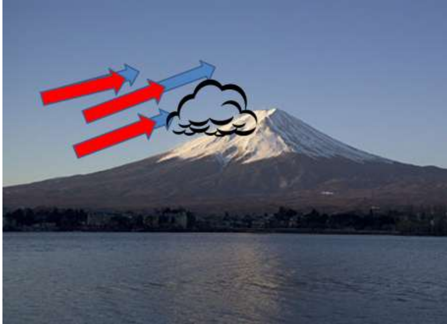
Figure 1: Diagram of how orographic lift creates clouds.

Interestingly enough, the local atmosphere has hardly any effect on the atmosphere above it, at least recognizably. When looking at the sky from the picture, no clouds are visible. The temperature around Boulder this day reached a high of 75°F. This was the hottest recorded day in Boulder history. 1 While the temperature was quite high for what we typically see in March in Boulder, the skew-T will tell us more about the conditions surrounding the general atmosphere.