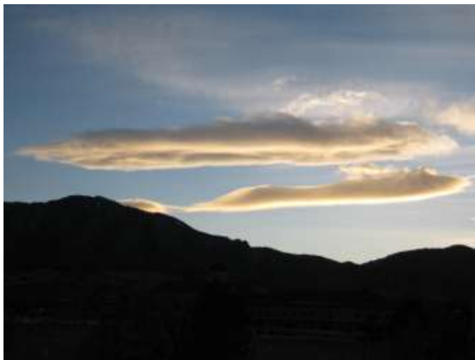
Figure 1 – Original Photograph

The purpose of this image was to capture and analyze a cloud formation that was interesting. Clouds are visible masses of condensed water (or ice crystals) that are in the saturated atmosphere [3]. Whether a particular cloud forms close to the ground, in the troposphere, or higher up in the stratosphere or even the mesosphere is dependent on the moisture content of the air and the atmospheric conditions that surround the cloud. Stability, moisture, wind speed, temperature, pressure and other factors all contribute to the appearance of the cloud and define it such that it can be classified. The Cloud Appreciation Society, a group that keeps an active record of what defines and classifies cloud types, has good information on all sorts of cloud species and examples [2]. In my particular image, I was trying to capture the beauty of a sunset's colors as well as the uniqueness of the altocumulus lenticularis that can be seen in the center and lower-right portion of the image. The original image looked as follows: