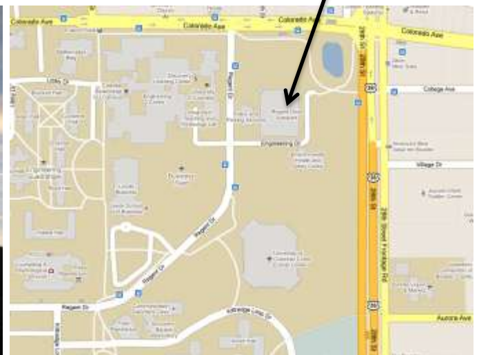
Figure 2 – Location [Google Maps]