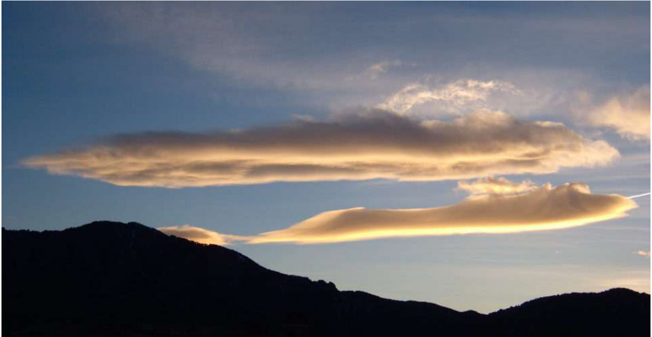
Figure 4 - Final Image