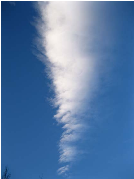
Figure 1: Cloud Image

The image shown was taken in Boulder, CO by Table Mesa. The purpose of the image is to capture an intriguing cloud formation. The cloud represents a mountain wave cloud taken on a windy day in February. The tree is captured in the image to provide scale for the picture.