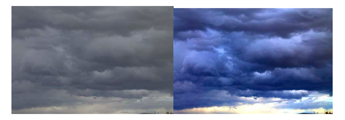
See what I mean?

images are 4272 × 2848 pixels. The exposure time was 1/200<sup>th</sup> of a second, with an fstop of 9. The digital manipulation of the image was rather heavy, for I wanted to make an image that could be appealing to the common viewer, and as a rule, normal people don't find clouds visually interesting unless they are in black and white or have intense colors. On the left, the original (boring image) and on the right is the edited (jaw-dropping) one: