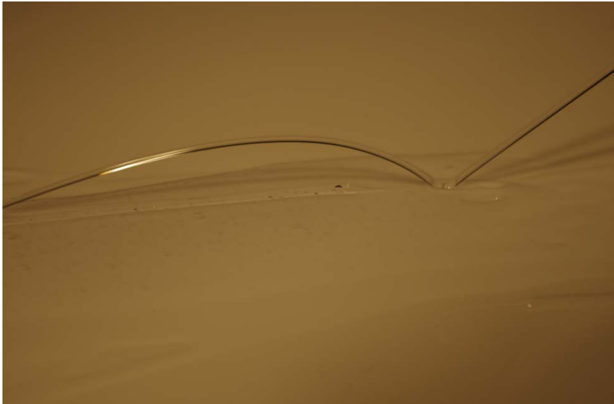
Figure 3. Untouched image

The photograph color was enhanced in GIMP using the color hue modulation, to change the image from white and yellow to blue. The single stream was replicated using the clone brush tool. The clone tool was used on the photo file, so the original dimensions were preserved.