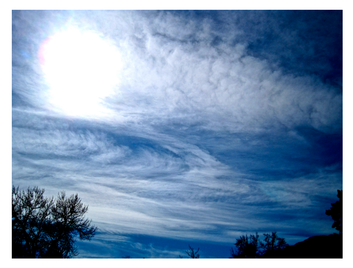
Figure 1: Photoshop Enhanced Image

This image was taken for the 1<sup>st</sup> cloud assignment in the class titled Flow Visualization. Its purpose was to familiarize us with the beauty and fluid characteristics of clouds. Clouds can enlighten us about future weather, current humidity, stability and many other things. The intent of this image was to capture a breathtaking image of clouds in an effort to describe the weather and atmospheric stability at the time of the picture. Clouds known as cirrus are the prelude to most weather systems; these are among the clouds portrayed in this image.