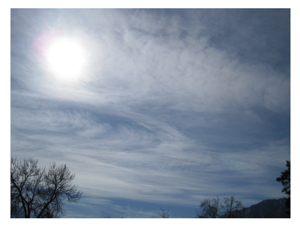
Figure 3: Original Image

The Skew T (figure 2) shows the right line (dew point) moving in an unexpected direction and closer to the left line (temperature) between 4,000 and 6,000 meters and at approximately 10,000 meters. This designates the two likely elevations for clouds to form on this day at this hour. This supports the fact that the two clouds seen in this image are most likely cirrus or altocumulus. The cirrus clouds and swiftly changing cloud formations due to the wind indicate that there was a front moving in [4]. This observation is important because the day after this image was captured, it snowed. The atmosphere was stable on this day as the CAPE value was equal to zero. The atmosphere only becomes unstable when the value is above zero.