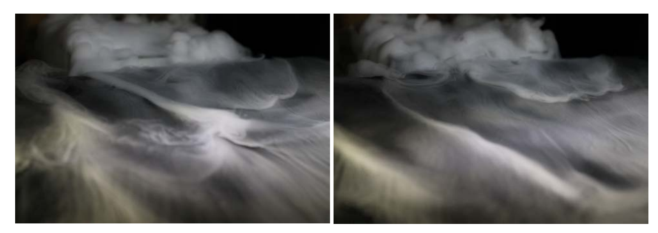
Figure 2: Wave propagation over 1 second

To calculate the Reynolds number of the flow, one must first calculate the velocity of the flow. This can be accomplished by analyzing the movement of the waves between two images taken at close to the same time. Two