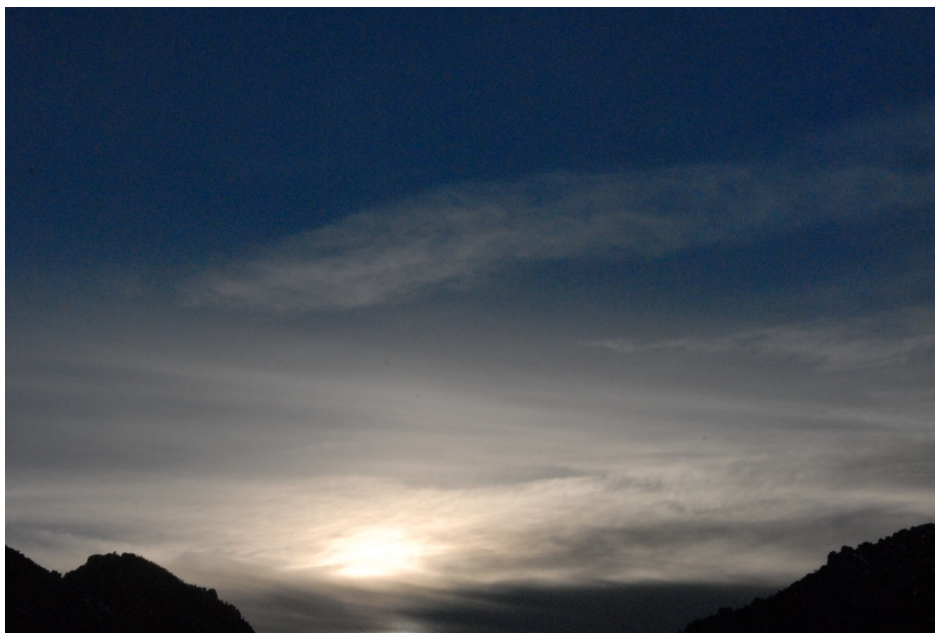
Figure 2 Mountain wave clouds (unedited)