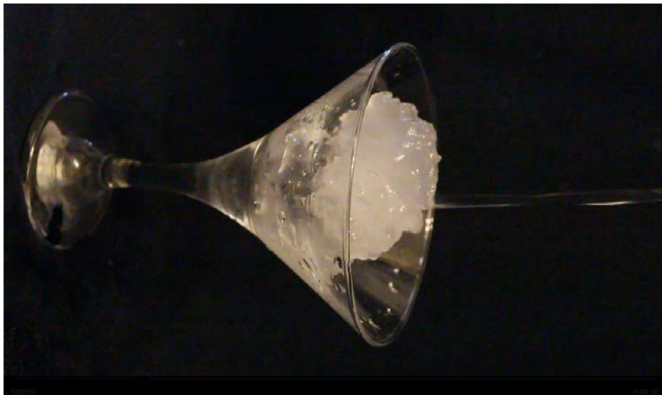
Figure 4: Image taken from original video

The video editing was performed in Windows Movie Maker 6.0 with the intent to make minor adjustments to the original video in order to enhance the understanding of the phenomena. These adjustments were to rotate the video 90 degrees so that it was facing upright, and to slow down the speed of the video to half speed in order to allow a better understanding of the phenomena occurring. When the video played at the original frame rate, the state change and motion were occurring too fast for a clear visualization of the nucleation and much of the detail was going unnoticed with the high playback rate. All other video elements, such as lighting, color, and vibrancy remained the same as the original video. A final addition was added to the movie in order to put a crowning finish on the movie. That was to include an original score composed by Daniel Morrison specifically made for this video. The original video for obvious reasons, could not be included in this report but an image extracted from the original video can be seen below in figure four.