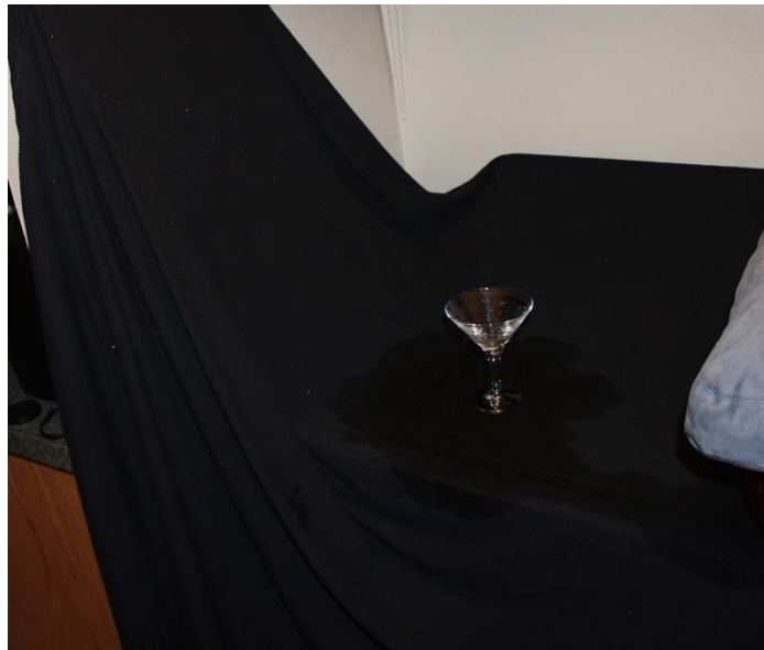
Figure 2: Image of actual setup