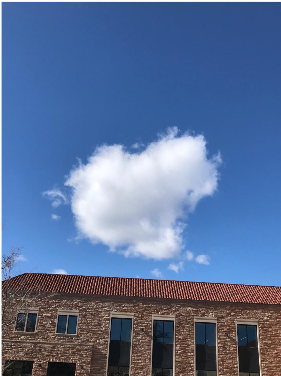
Figure 1: Pre-Photoshop/Original Image

I captured a picture of cloud. The phenomenon I found a fluffy cloud right above the REC center and I decided to use that cloud as my submission of Cloud First Image. I wanted to make the cloud fluffy in the image, so I focused on the surface of cloud and make the cloud at the center of frame. The sky was clear and very bright blue, so the cloud was seen very well.