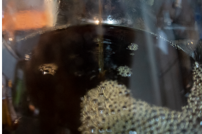
Figure 2: Raw Image Taken

The flow visualized in figure 2 is that of a fluid drip caused by gravity as it is pushed through a filter and undergone a brewing process, which is a form of extracting the compounds found in coffee into a liquid form. The most common compounds found in a coffee bean are, polysaccharides, proteins, lipids and minerals. When a coffee bean is roasted, the sugars or polysaccharides and amino acids perform a profusion, under the Maillard reaction. During this reaction CO 2 is also introduced into the bean to resist oxidation and prolong the shelf life of the beans. These are extracted through the brewing process, the first pour we did in the experiment releases a majority of this CO 2 however due to the introduction of heat and the open container of the Chemex. However, some of the CO 2 is captured in the fluid as it travels through the coffee grounds and filter into the bottom of the Chemex where it is released as the bubbles we see forming on the surface of fluid container. We also can see the fluid flowing from the bottom of the filter into the carafe, this flow is accelerated by gravity, but is a secondary flow phenomenon to the main objective of the experiment.