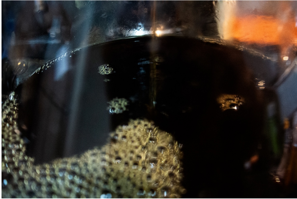
Figure 3: Final Published Image

this experiment is a Nikon J1 mirrorless camera with a 10-30 1 Nikkor lens, which has a focal length of 10-30mm and aperture of 3.5-16. The image was taken with a focal length of 11.4, aperture of 3.5, and an exposure time of 1/30. After the raw image was captured the photo was post processed in adobe photo shop using the curves tool to bring make the dark pixels darker and lighter pictures lighter. The final result of post processing can be seen in Figure 3.