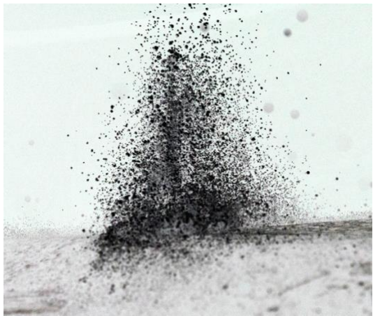
Figure 4: Final Production Image

Figure 4 shows how particles exhibit projectile motion when experiencing an impulse function from beneath the pile. I like the randomness exhibited in the photo and how inverting the colors makes the closer particles really defined. Wish the image had a little more definition of the entire flow and not the closer particles even if it visually is very pleasing. The image blur is minimal and finding the velocity of the particles would be a very valuable piece of information. Lastly creating a more controlled experiment could aid in finding the flow phenomenon occurring in this situation.