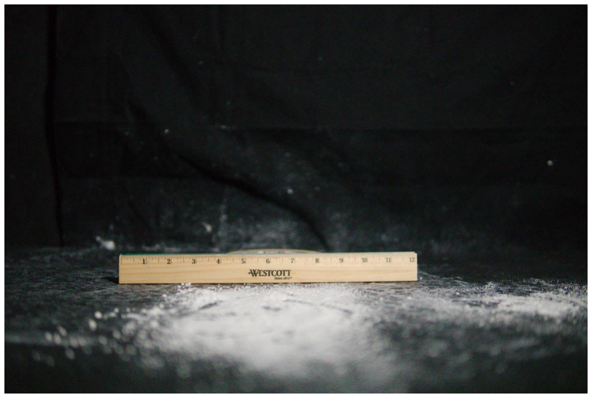
Figure 3: Field of View of the Image Taken