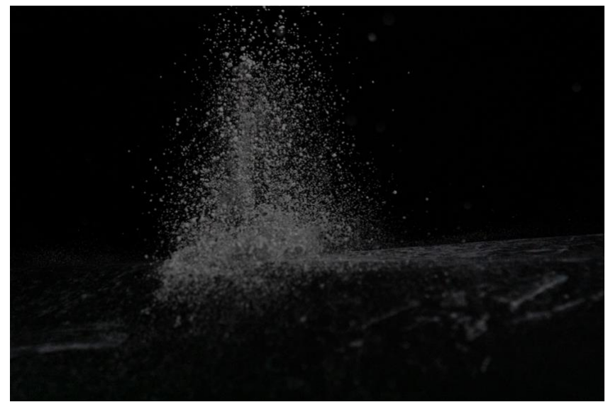
Figure 2: Original Image of Flow

This flow is visualizing small particles experiencing an impulse force from paper being tightened. This gives the particles an initial velocity that is then opposed by gravity as they travel upwards. Due to irregularities in the chalk surface among other unaccountable interactions the particles act along a projectile motion path. However, the chalk particles can interact with the each other as they travel through the air. The particles also undergo drag while traveling through the air causing their motion to be drastically stunted compared to similar motion experienced in a vacuum [1]. Overall the flow can be modeled as projectile motion with air drag.