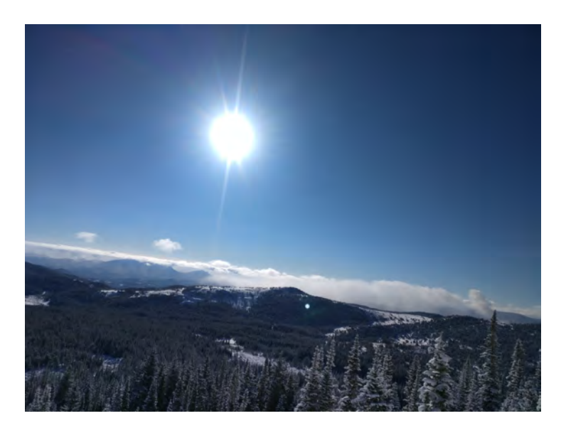
Figure 2: Raw image