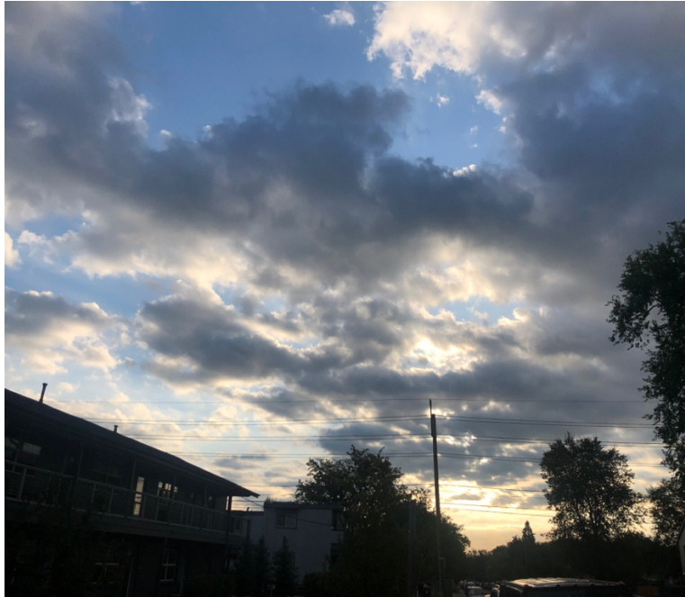
Figure 2. Original photo