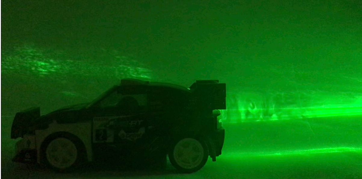
Figure 1. Final edited version of the image.