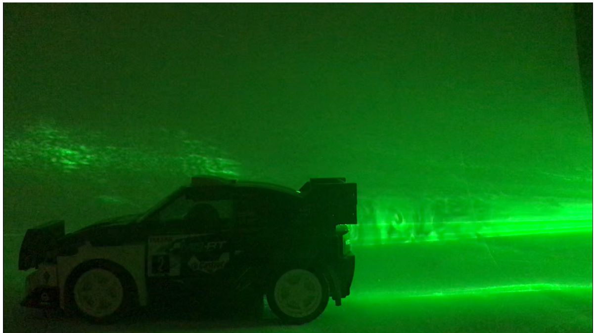
Figure 2. The original image.