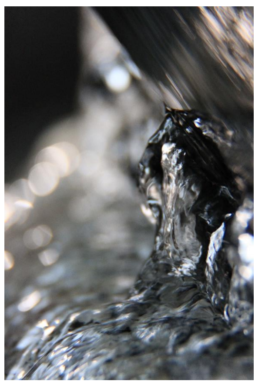
Figure 3- Original image before post processing