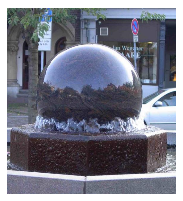
Figure 1- Spherical water feature similar to that photographed in Get Wet image.

I am very excited to speak about my first image for the class Flow Visualization. The overall objective of the first assignment was to get your feet wet and just start taking pictures of flows. There were not much guidelines to subject choice, which led to me taking many different styles of photos before deciding upon this one. This photo is taken outside at 2pm on a sunny day. The subject was the spherical water feature outside of the Discovery Learning Center on the CU Boulder Campus. You can see a photo of the style of the fountain below in Figure 1. I attempted to take several close-up macro