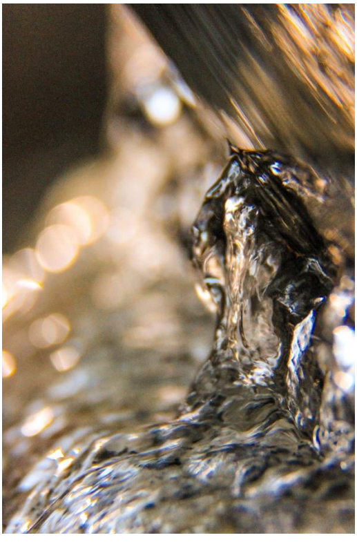
Figure 4-Final image after post processing