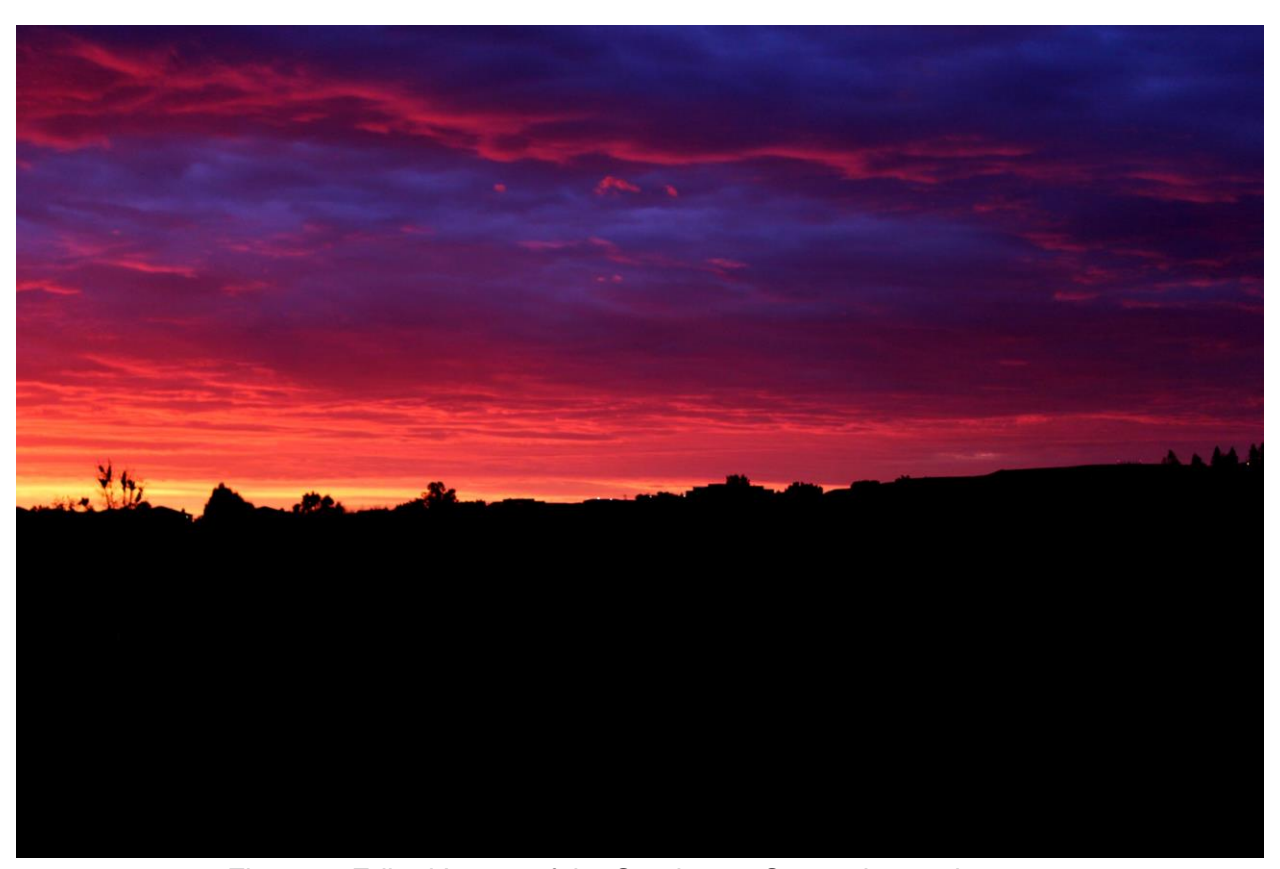
Figure 3: Edited Image of the Sunrise on September 30th, 2016

The camera I used to take the image was a Canon EOS Rebel T5 with an 18-55mm lens. The ISO was set to 400 and a f stop of f/5. Since the f stop was small I was able to get a relatively large depth of field. The original image size was 5184 x 3456 pixels. The lens focal length was set to 39mm. Below in Figure 3 is the edited image I made using the GIMP software.