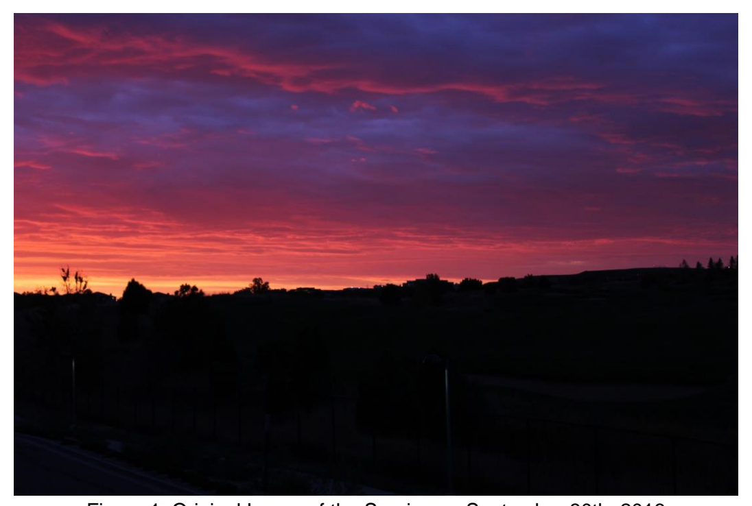
Figure 1: Original Image of the Sunrise on September 30th, 2016

I woke up early on September 30th to the sun barely beginning to light up the sky. I noticed the changing color as I began to eat breakfast. I ran to grab my camera and went out on my deck at my apartment. My deck was on the second floor overlooking a golf course in Broomfield, CO. The image was taken looking southeast at around 6:30 am. I was able to keep the camera relatively level looking straight out toward downtown Denver. The original image taken is shown below in Figure 1.