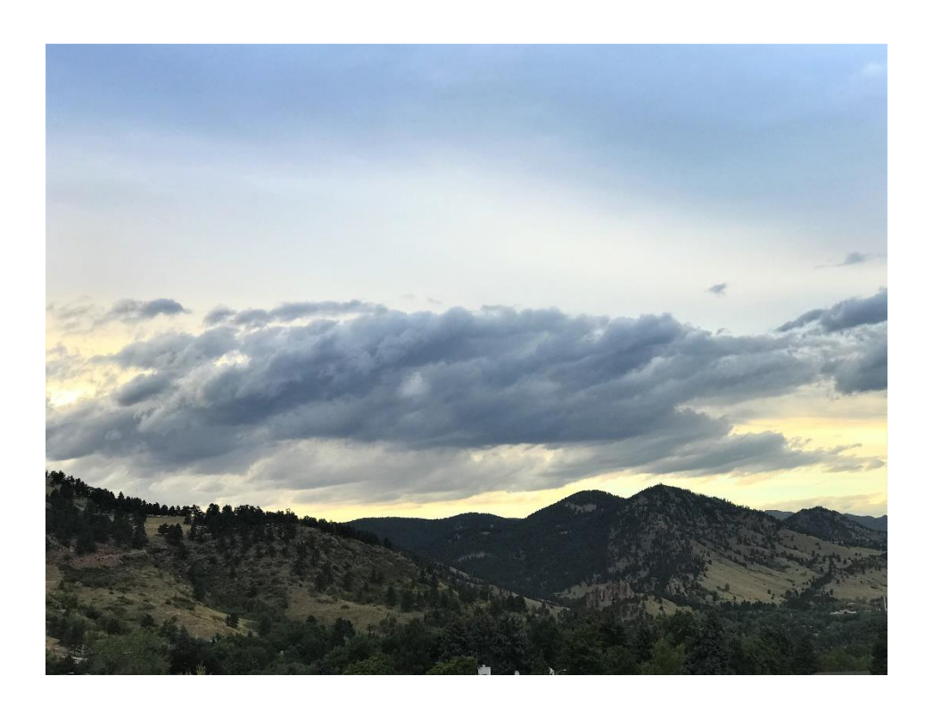
Figure 2: Cloud 1 picture after manipulation

The image shows the cloud at sunset with mountains at the background which provided the picture with some interesting and beautiful colors.