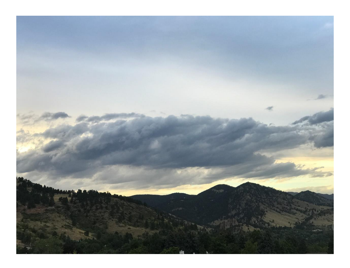
Figure1: Cloud 1 raw picture

The graph above shows CAPE as being zero which indicate that the weather was stable at that day. Based on the weather condition being stable, the height of the clouds and that it was not raining, the type of the cloud is Stratocumulus.