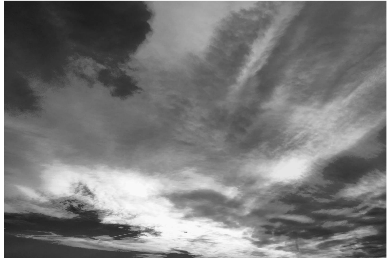
Figure 1: Final cloud image taken just east of Denver, Colorado November 16<sup>th</sup>, 2018

This image captured the sky east of Denver, Colorado on November 16, 2018. A temperate morning in the middle of November, had a sheet of high clouds covering the sky. The sun rays shining through the light and in some spots transparent clouds. With the help of the post-processor gimp, the clouds are highlighted to give an omnipotent presence.