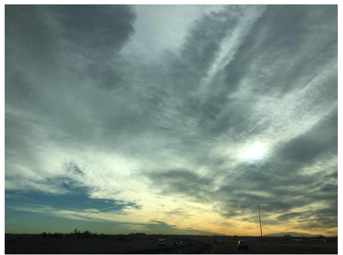
Figure 3: Unedited cloud image. An early morning image taken just east of Denver, Colorado.

The image was taken on an iPhone 6s. The dimensions of the image were 4032 \times 3024 pixels with a 72x72 dpi resolution. The exposure time was 1/2653 sec, with an ISO speed of 25. The focal length of the micro lensed camera was a fixed length of 35 mm.