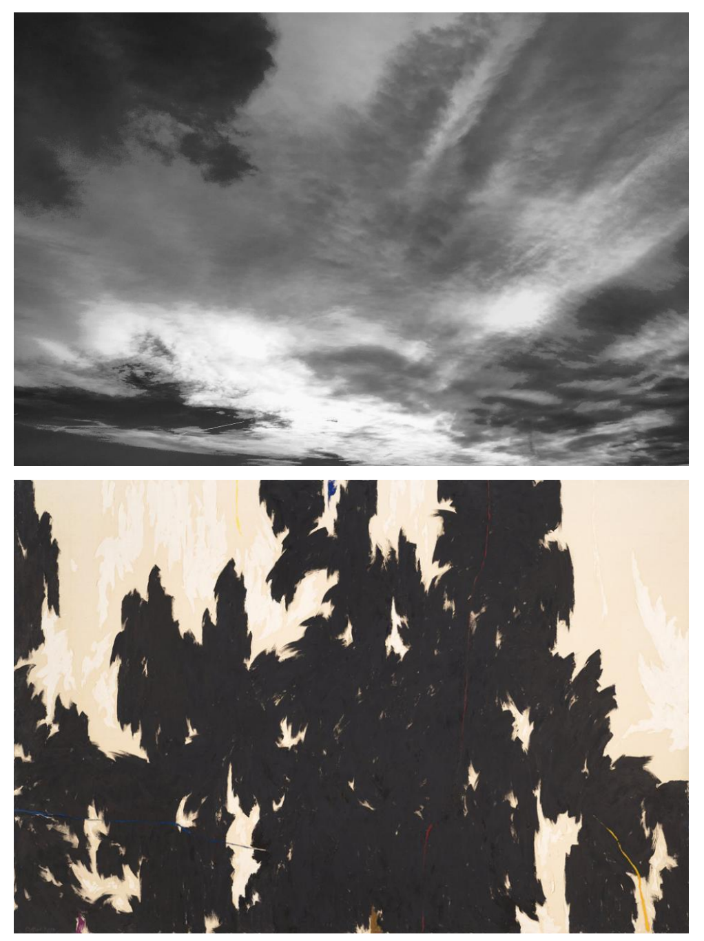
Figure 4: (a) Cloud image (b) Clyfford Still PH-929 [3]

If I were to repeat this image, I would focus on bring out some other tones and staying away from grey scale. With the post-processing capabilities, I might have kept a few muted yellow and contrast them with stark whites and blacks.