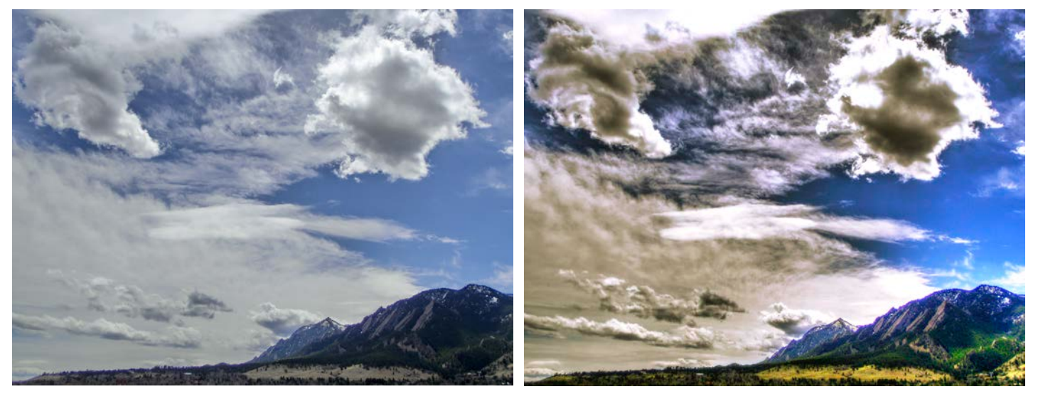
Figure 4 - Before (left) and after (right) post-processing images

The flatirons were roughly 2 miles away from where I took the picture, and I would estimate the size of the field of view is approximately 1.5 miles horizontally. The final image also contained a decent amount of post-processing. I manually created three separate exposures of the image, and performed additional HDR tone-mapping processing in Photomatix Pro. The resulting image was then edited in Photoshop CS5. Levels, curves, brightness, contrast, saturation and color balancing were performed. I manually selected the sky and edited it separately from the mountains, helping to create that unique light in the image. The before and after processing images can be seen in Figure 4.