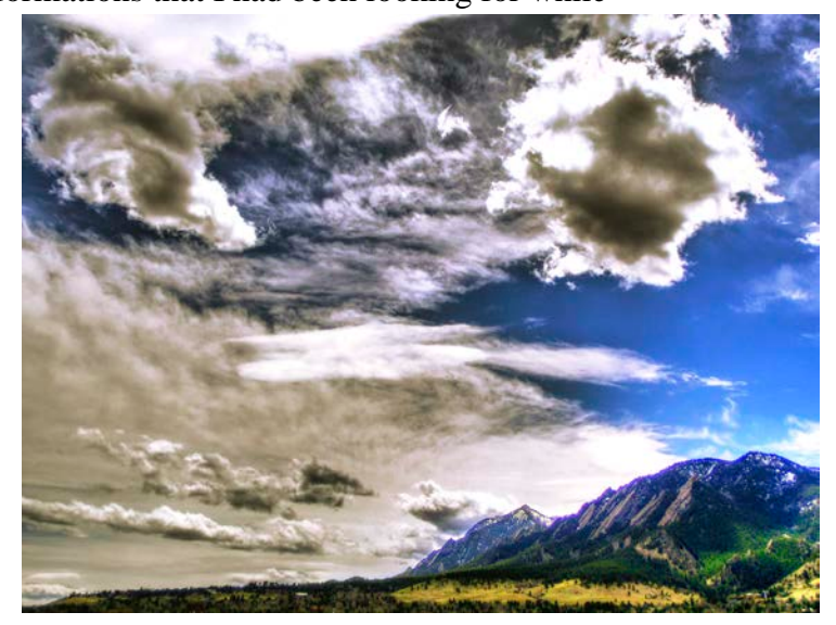
Figure 1 - Final Image

As mentioned, this image was taken on April 6<sup>th</sup>, 2013 on the Pearl Street mall in Boulder,