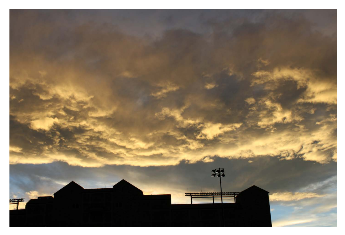
Figure 2: Original Image

The cloud is roughly 1 mile away from the camera and the photo was taken with a Canon EOS Digital Rebel XS with no external lighting. The F-stop was f/9, the exposure time was 1/125 seconds with a focal length of 30 millimeters and the ISO value is 200. The original and edited images were 3888 by 2592 and 3888 by 2517 pixels respectively. The original image seen below was Photoshoped by rotating the image to make stadium level with the bottom of the image and the curves were adjusted to darken the stadium and enhance the color in the clouds.