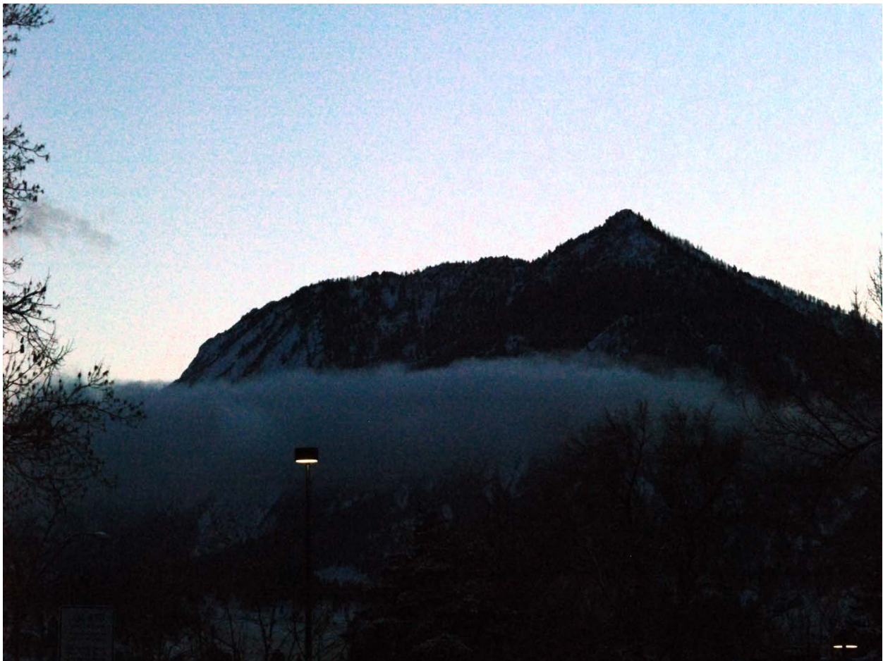
Figure 1: Low Flatirons Cloud Image