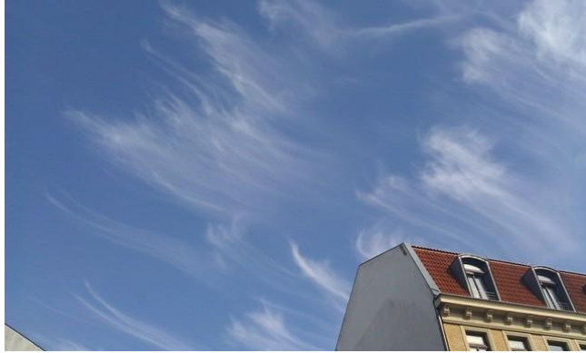
Figure 2: Cirrus uncinus in Leipzig, Germany 2

delicate, white streaks, patches, or bands of falling ice crystals, [cirrus clouds] are detached from each other and have fibrous or silky appearances.” 1 Clouds-online.com describes cirrus clouds as fibrous, threadlike, white feather clouds of ice crystals, whose form resembles hair curls. 2 The best fit for a subspecies is the uncinus since it has fallstreaks that are the shape of hooks or commas. 1 There are three defined hooks within the cloud. Figures 2 and 3 show examples of cirrus uncinus.