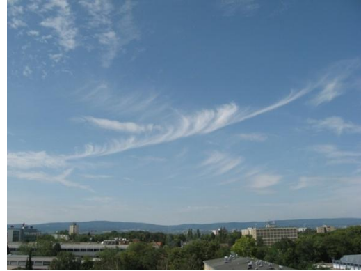
Figure 3: Cirrus uncinus in Mainz, Germany

Cirrus clouds are usually an indicator of changing weather for the worse. After 4 April the pressure continued to drop for three days until a low pressure system arrived, bringing with it cold temperatures and some precipitation.