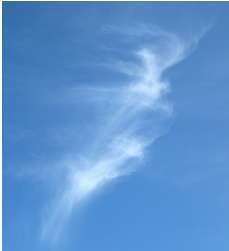
Figure 1: Submitted image for project

The photo location was on the University of Colorado campus in Boulder, CO, near the Coors Center. The photo was captured on 4 April at roughly 0940. It was a very beautiful day with blue skies and the occasional cloud. The cloud that I took an image of was above the Engineering Center, about north-northwest from where I was standing. The camera was facing roughly 80 degrees from the horizon. The area is around 5600 feet above sea level.