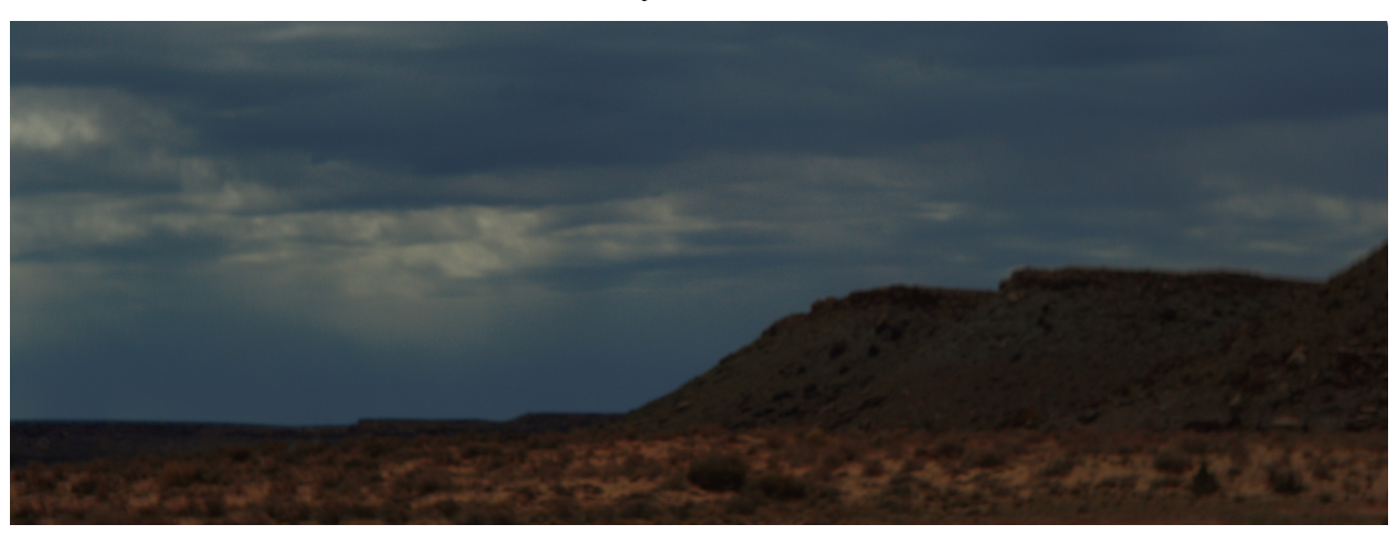
Cumulus clouds over Utah desert MCEN 5151-Clouds Image #2 Wayne Russell