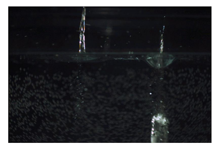
Figure 2: Still image from the video of the jets left behind after the balls were dropped. Note the lack of the jet for the center, room temperature, ball.

room temperature ball leaves very little mark. The hot balls also leave behind a large wake compared to the room temperature ball.