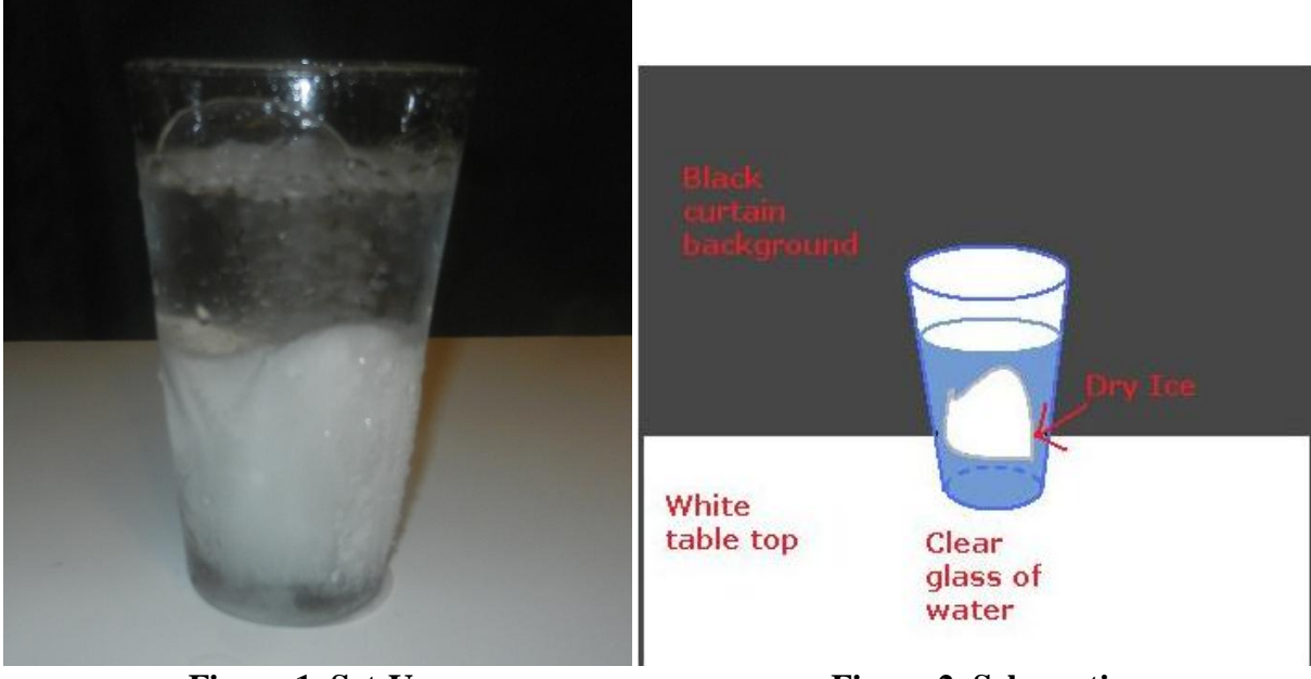
Figure 1. Set-Up

With the use of the aforementioned items, the experiment can be conducted. One important note is that dry ice typically sublimates at a rate of 5 to 10 pounds every 24 hours. As such, it must be purchased as close to the experimentation time as possible. Another important detail is that the temperature of the water affects the amount of fog produced by dry ice. Warmer water produces more fog. Depending on the intention of the experiment, the appropriate temperature of water is required. For this experiment, a clear glass of water is filled with lukewarm water from a tap. Then, a chunk of dry ice, close to 1/6lb in weight, is placed in the glass of water. Immediately, the reaction will produce fog. Over time, as the water cools, the amount of fog produced will decrease. In order to light this experiment, a bedroom light was turned on, as well as the flash setting on the camera. The clear glass of dry ice was placed on a white table top, and the image was shot from above the glass in order to capture a clean background. A schematic of the experimental set-up is shown directly below.