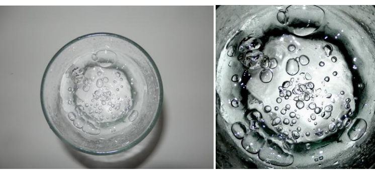
Figure 5. Original Image

The image chosen from this experiment successfully demonstrates the phenomenon of the lack of fog from the dry ice and displays the reaction of dry ice and water. The images below demonstrate this comparison between the original and edited images.