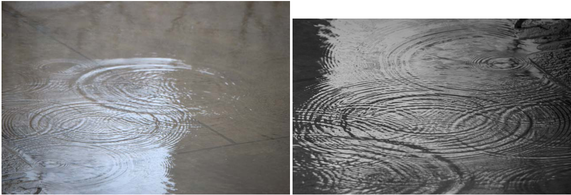
Figure 2. Before (Left) and After (Right) Images

The field of view for the final image is about 2 feet wide by 1 foot tall. This field of view allowed for the ability to capture the details in the waves as well as being able to see the full rings. Since I did not want the camera to get wet during the photographing of this image, I stood below the overhang of the engineering center. Thus, I was roughly 6 feet from the puddle. For this reason a focal length of 120mm was used to zoom in tight while remaining a good distance from the puddle. The type of camera that was used was a Nikon D60 and the original capture output a 3900 x 2613 pixel photo. After cropping, the photo became 2800 x 1964 pixels. To get the exposure that was captured an aperture of f/5 was used. This allowed a deeper depth of field while still being able to use a fast shutter speed to minimize motion blur in the waves. The shutter speed that was used was 1/250 of a second and the ISO was set to 100 to minimize noise in the image. After the photo was taken, Photoshop was used to simply crop, rotate, and increase the contrast in the image. In Figure 2 a before and after image can be seen.