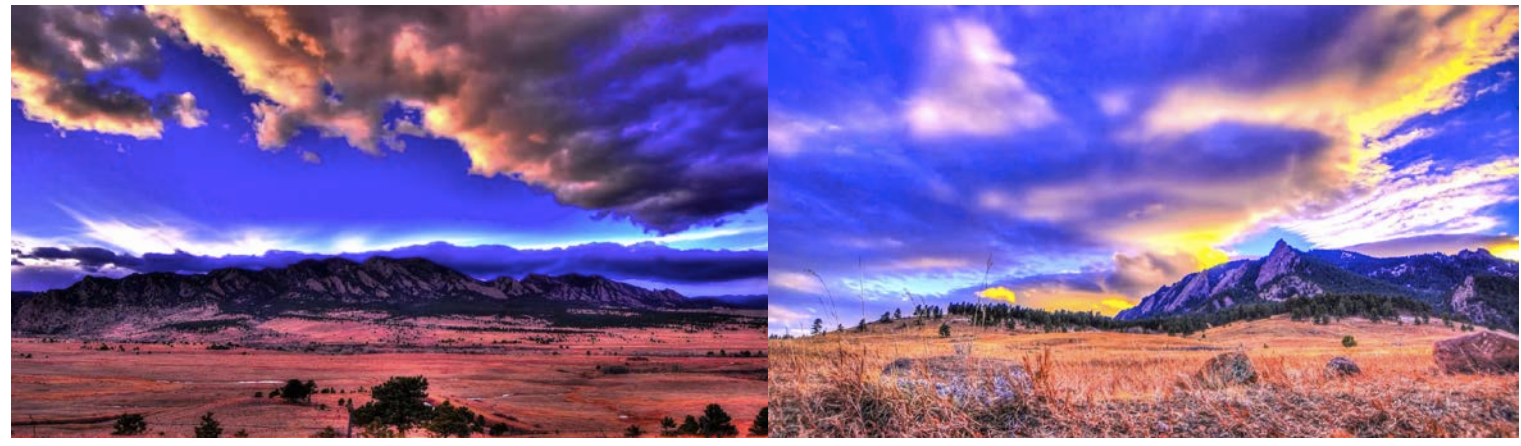
Figure 1 – Timelapse #1 (left) and timelapse #2 (right)