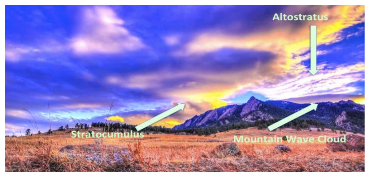
Figure 4 – Timelapse #2 cloud formation

The days leading up to January 24<sup>th</sup> and the following day were very calm with no storms. The atmosphere was stable, which can be seen in the left Skew-T diagram in Figure 3. The slope of the black temperature gradient line is steeper than that of the dry adiabatic line shown in green. The CAPE value, which is a measure of the available potential energy of the air, was given with the Skew-T diagram to be 0, indicating a stable atmosphere <sup>[3]</sup>.