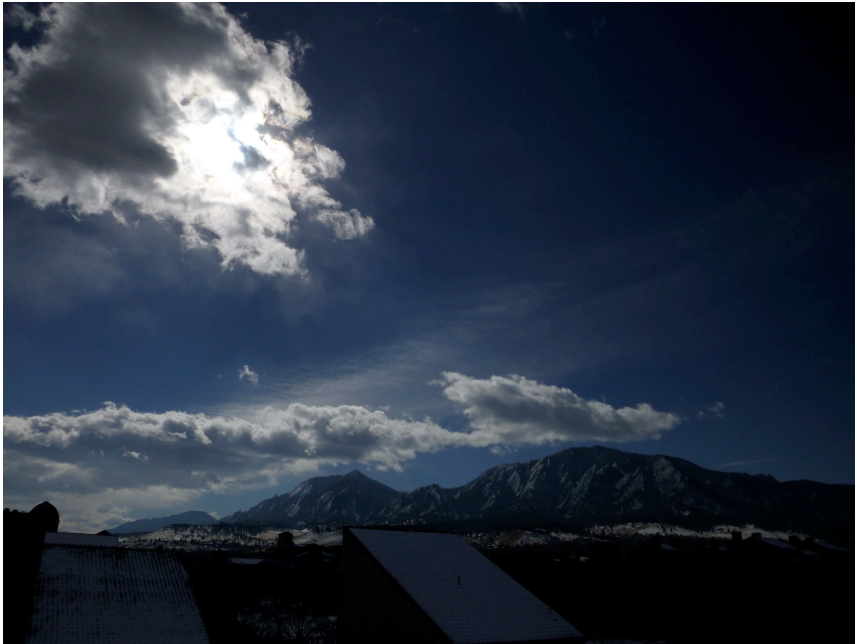
Figure 4: Original Image

The image was processed using Gimp photo editing software from its original state as seen in Figure 4. The image was first cropped from an original size of 4608x3456 pixels to 3916x2816 in order to eliminate the edges of buildings that did not add to the artistic quality of the image. The color was then adjusted using the transfer function curves to increase