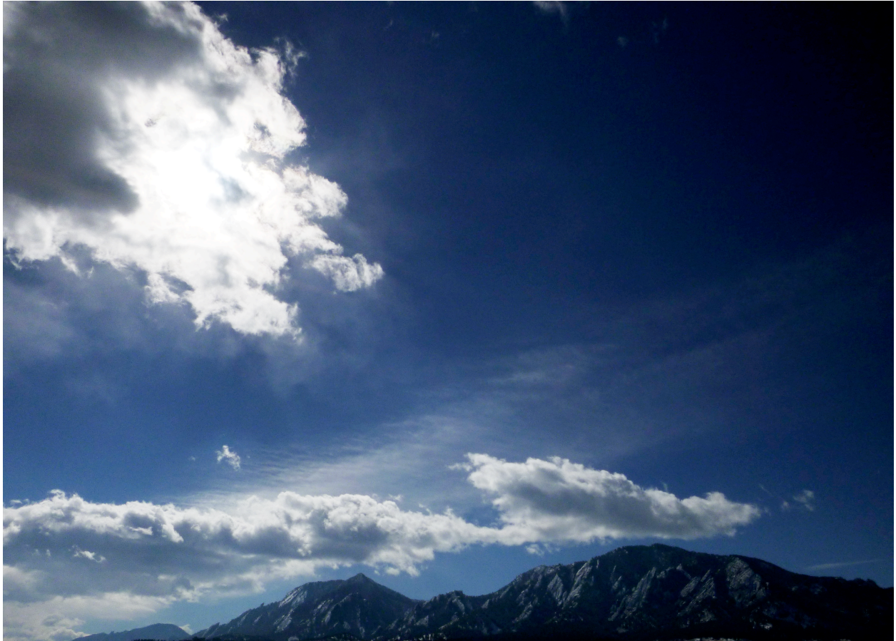
Figure 1: Mountain wave clouds over Boulder's Flatirons formation

Gabriel Bershenyi 1 University of Colorado, Boulder