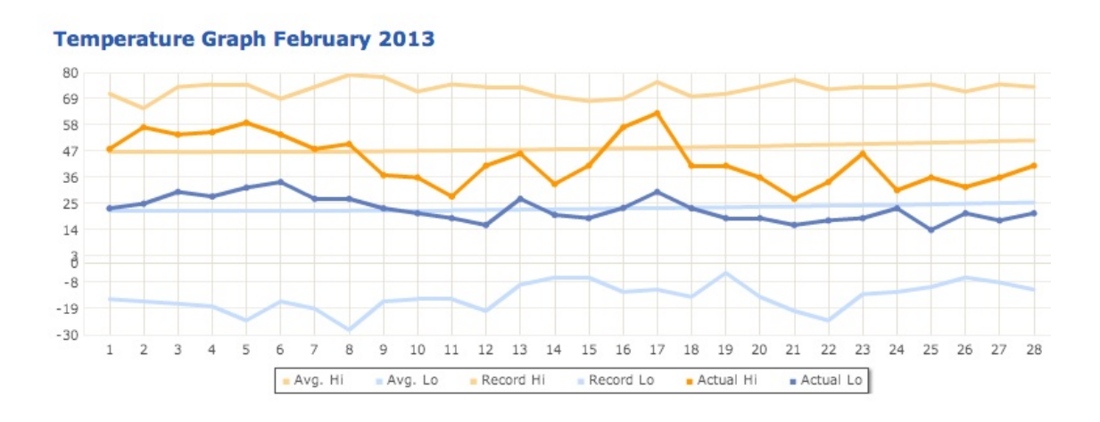
Figure 2: February Temperatures for Boulder, CO

The clouds in the image are altocumulus perlucidus, which are characterized by light, puffy appearance with openings or spaces between formations. Altocumulus clouds typically indicate shallow convection. As it was previously stated, this image was captured midday on February 20. The sky was slightly overcast, with no precipitation. Figure 2 shows a slight cold front in the days following the image was taken [1]. This is typical for the presence of altocumus clouds. Also, it snowed later that night, which is another indication that these are altocumulus perlucidus, as precipitation is likely within 15-20 hours when they are present [2].