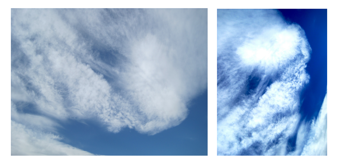
Figure 4: Original and Final Image

The image captured reveals the beauty of mid-level cloud dynamics. Being an altocumulus cloud formation, it is comprised mainly of water droplets and ice crystals. Altocumulus clouds generally form by convection prior to a cold front, which is due to an instability within the moist cloud layer. The image dramatically captures the undulation of these layers. Overall, I am extremely satisfied with the final image. I feel it successfully conveys the beauty of cloud flow dynamics. I performed some post-processing in Photoshop to enhance the colors and contrast, as well as the exposure. The original and final images are shown in Figure 4.