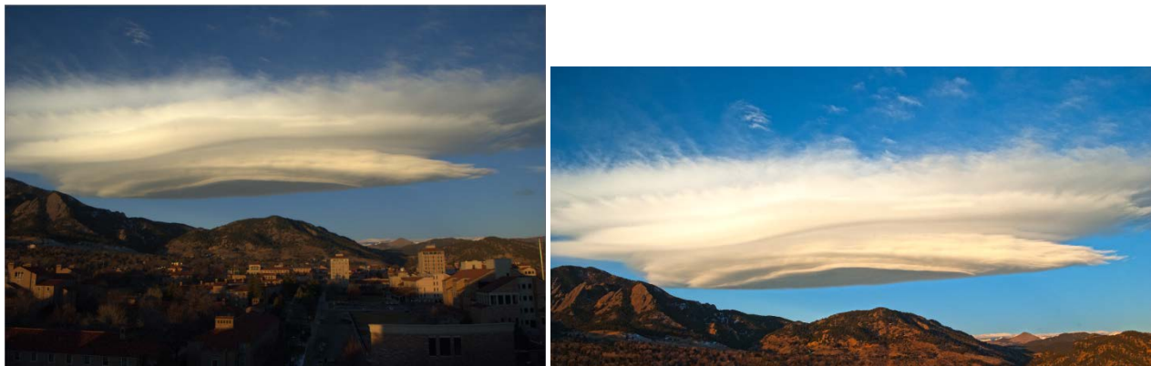
Figure 2. Original image (left) and final image (right)

The photographic technique that was used was simply to capture the full cloud as clearly as possible since the photo was being taken through a window. The cloud could be assumed to be at an infinite distance when concerning the depth of field. As discussed previously, the field of view from left to right is approximately 5 kilometers, and from top to bottom is about 2.5 kilometers. Since the clouds form above mountains, it is assumed that the linear distance to the mountain below the cloud is approximately the distance to the front edge of the cloud. Using GoogleMaps, a distance from the engineering center to the mountain in the image is about 4 kilometers. The focal length that was used was 18 millimeters which allows the maximum field of view with the lens that was on the camera. The image was taken with a Nikon D60 DSLR in the RAW formatting mode. The original and final images, which can be seen in Figure 2, have a pixel height and width of 3,900x2613 and 3200x2613 respectively.