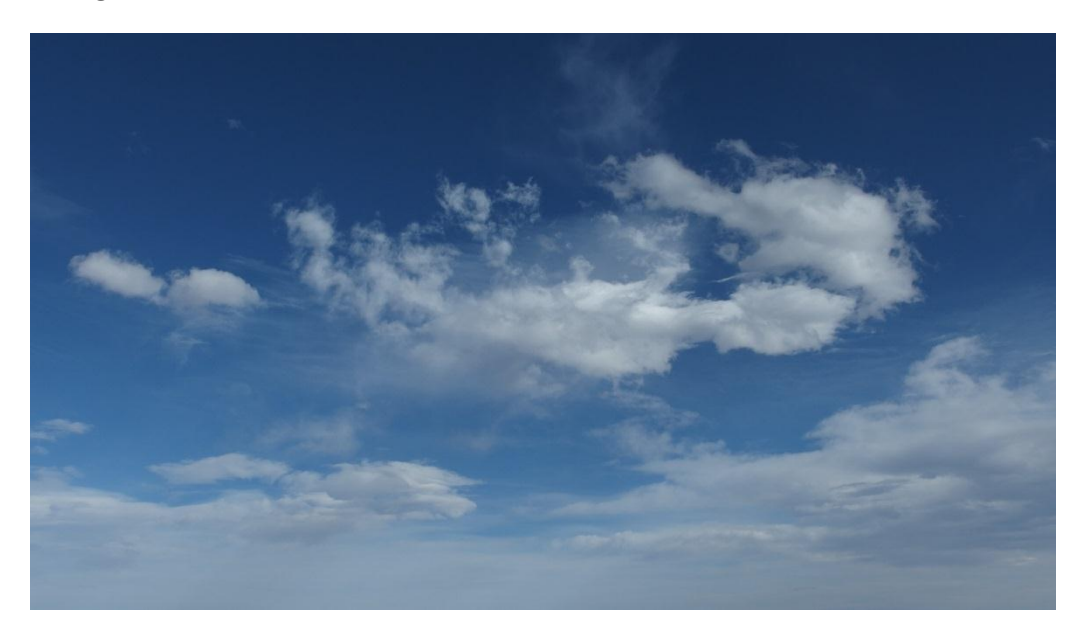
Figure 2: Original Image

The final photograph was taken with the Olympus Stylus XZ-2 digital camera. The field of view was at a large angle from horizontal, in an effort to remove any traces of Boulder at the bottom of the photograph. A 1.0x zoom was used, and the focal length was 6.4 mm (30.0 mm – 35mm equivalent). The shutter speed was 1/800 sec, the aperture size was F6.4, and the ISO was set at 100. The original image was 3968x2232 (16:9 ratio) pixels and taken in .JPEG format. The original photograph is shown in Figure 2. After some post-processing, the final image was 3968x2232 and .TIF format.