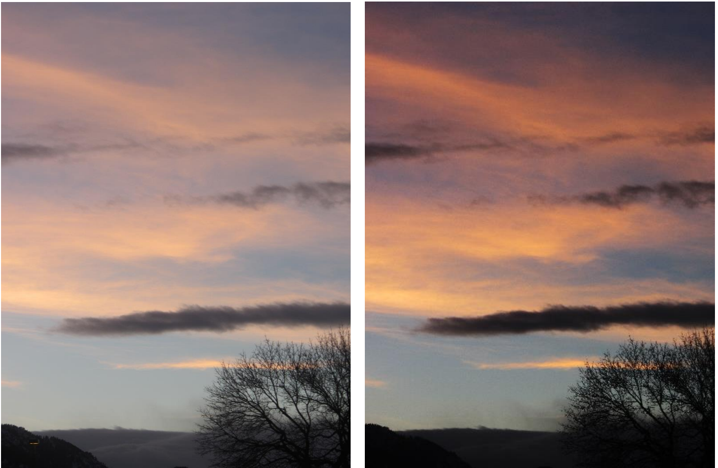
Figure 2: Before (left) and After (right) of Image