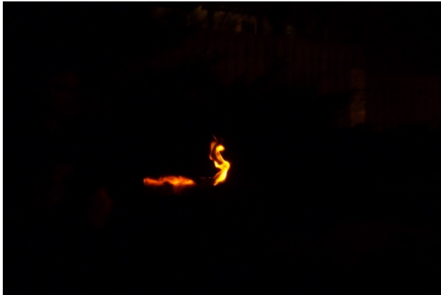
Figure 2: Original Image

The main visualization in the image is fire as seen in Figure 2 in the original image. The bottle adds an artful enclosure to the flames, but the fire is the primary visualization technique. Having all the necessary common household items to perform and photograph this experiment made it cheap and reproducible. To highlight the flame in the photograph, the image was taken in a dark corner of a parking lot on a night where there was not a lot of wind. I did not use the flash on my camera; rather, I let the light from the fire illuminate the scene in the image.