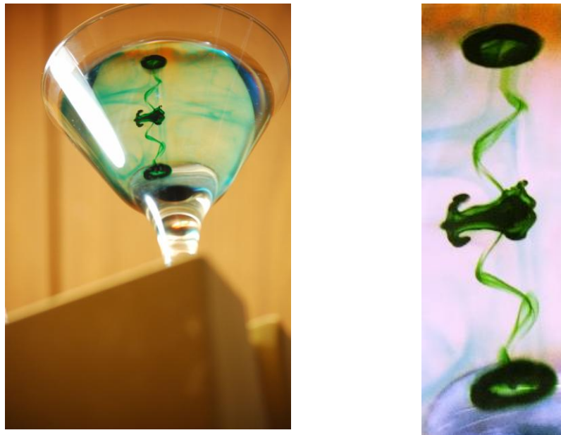
Figure 2. Image Before (Left) and After (Right)

For this image, there were various different decisions made to capture the desired result. The chosen photographic technique chosen was color photography. Figure 2 shows the image before and after post-processing in PhotoShop.