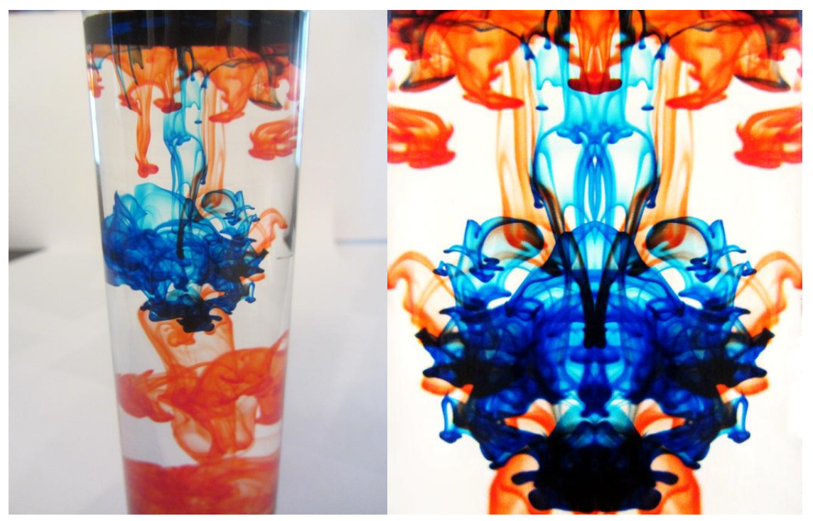
Figure 4: Before (left) and After (right) of Image

placed side by side itself. The spot healing tool was used to mesh the two halves together. A before and after of the image are shown in the Figure below.