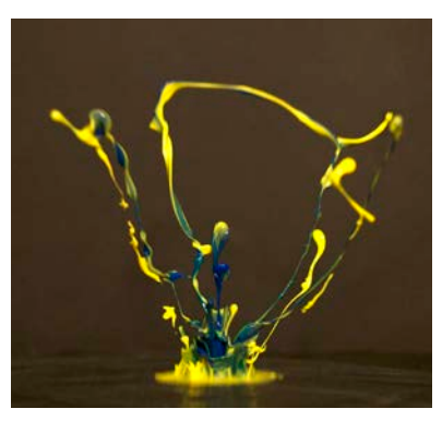
Figure 3: Edited (1385x1280)

Before taking more complex images, I tested different shutter speeds and aperture settings. I found that setting the shutter speed very high, and using an automatic f-stop setting worked best. The final specifications for this image are the following: ISO800, f/2.8, 1/1000.