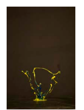
Figure 2: Original Image (2048x3072)

To capture this image, a digital Canon Rebel EOS camera was used. I chose to take the photo with a macro lens (Canon EFS, f/2.8, 60mm) because it had the ability to capture more detail, and let more light through compared to my other lenses. The splatter in this image is approximately 4 inches tall, and the camera was about three feet from the paint. The original and final images can be seen in Figures 2 and 3, respectively.