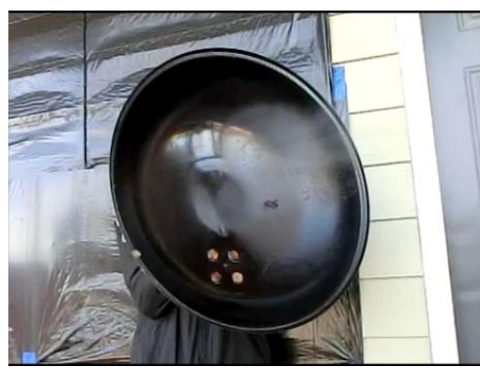
Figure 2: Smoke Vortex Ring in front of lid

This number puts the vortex ring into the turbulence regime, which was expected. The resulting ring is pictured in Figure 2.