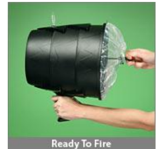
Figure 1: Airzooka 1