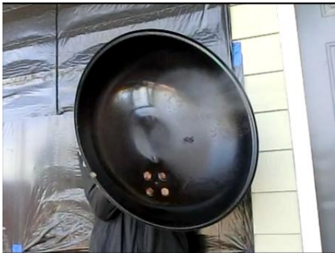
Figure 2: Smoke Vortex Ring in front of lid

This number puts the vortex ring into the turbulence regime, which was expected. The resulting ring is pictured in Figure 2.