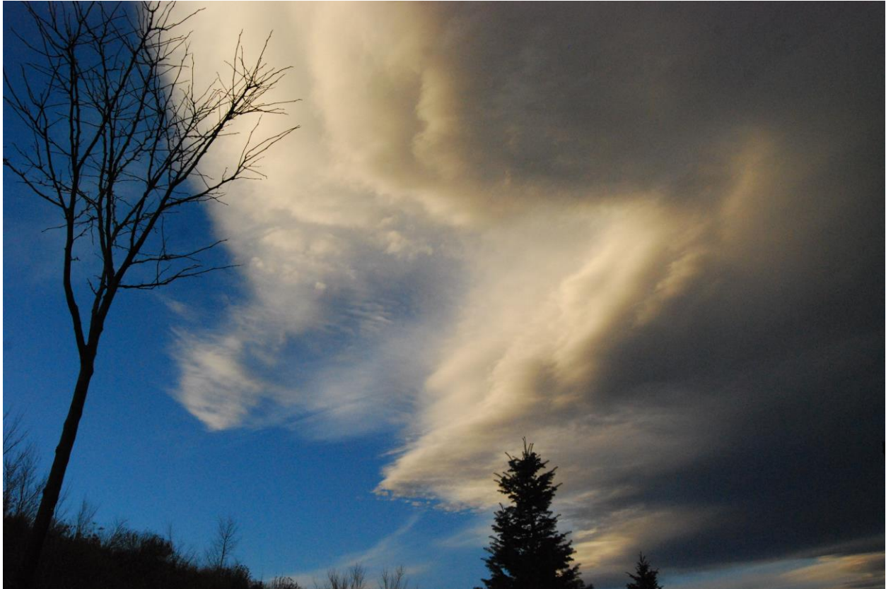
Figure 2: Original Image (3900 x 2613 pixels)

The image was captured using a Nikon D40X digital camera with a focal length of 19mm. I used the aperture-priority setting with an f-number of f/9, ISO of 1600, and shutter speed of 1/1250. I chose a high ISO because I didn't need a large depth of field, and I loved the natural light from the clouds, so I wanted a high sensitivity to capture it the best I could.