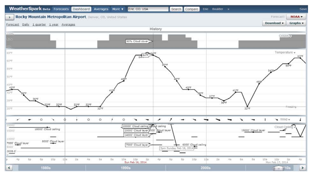
Figure 1 - Weather data from WeatherSpark.com<sup>1</sup>

This image captures several cumulus clouds. I determined this by looking at several sources. First of all, I had to determine the cloud elevation. WeatherSpark<sup>1</sup> is a great resource for finding this out, see figure 1 below.