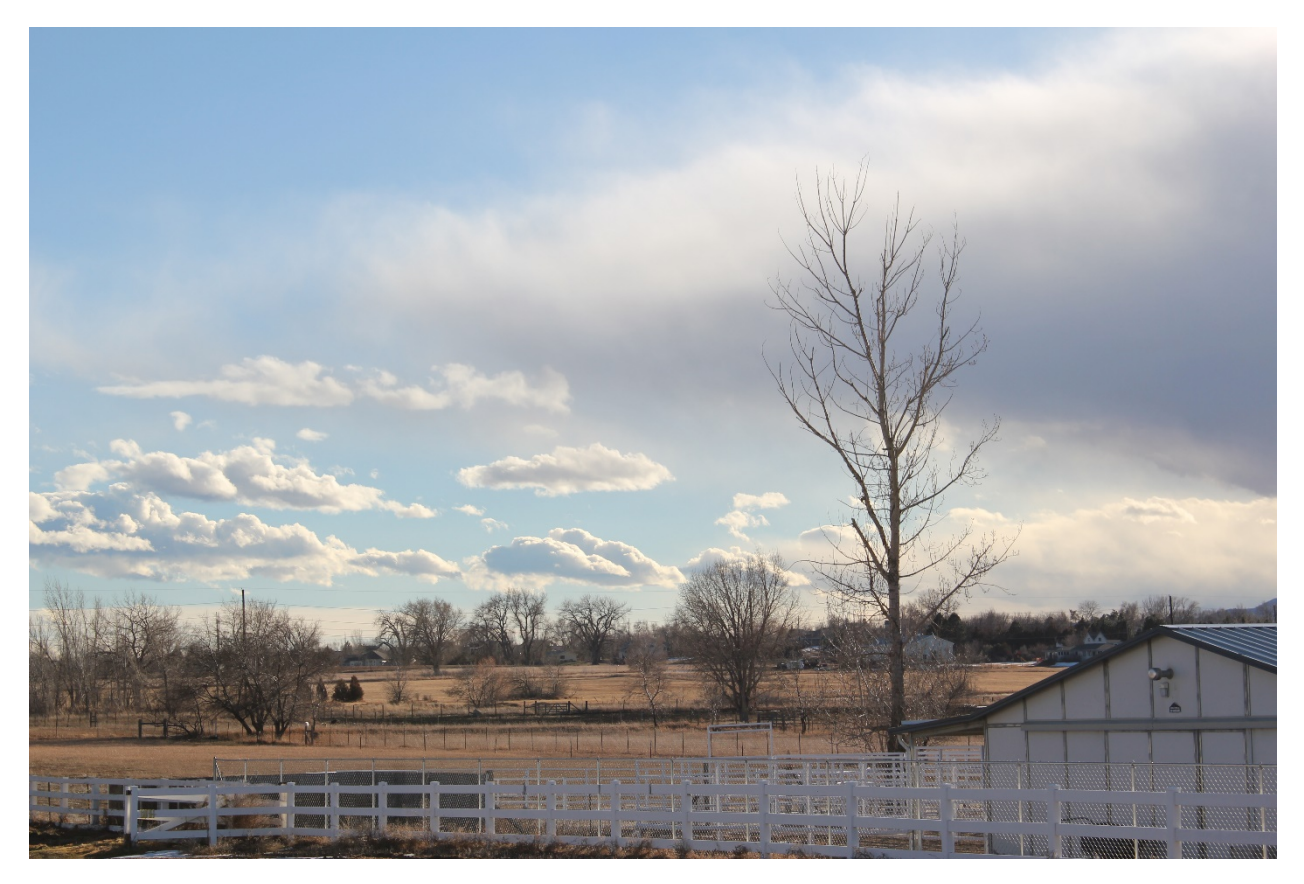
Figure 4 - Unedited cloud image

The field of view in this image is huge and I don't even know how to approximate it. It's probably several miles at the horizon where the clouds are. The photo itself has a pixel measurement of 5184x3456. For this photo, I really let the camera do everything automatically. I didn't want to start messing with shutter speed, ISO, and aperture and end up getting a blurry or oversaturated picture. Since the clouds are well defined, the camera is able to handle it much better than with other fluid pictures where there are no distinct edges. I think this was a good decision as I'm still not fully familiar with exactly how to pick out settings that will give a good looking picture. In this setting, my camera came up with a shutter speed of 1/250 second, and ISO setting of 100, and an f number of 10. I like what it did, the picture turned out quite well.