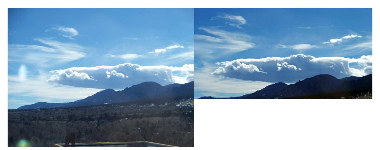
Figure 2: Pre-processed image (Left), Post-processed image (right)

For the post processing of the image, Adobe Photoshop CS5 was used. First, the photo was cropped from 4000 x 3000 pixels to 3524 x 1813 pixels. This was to remove much of the premountain foreground as well as the glare from the window on the left side of the image. Then minor adjustments were made to the levels and contrast of the image, as well as the sharpness to increase the visibility of the features of the clouds without adding too much grain.