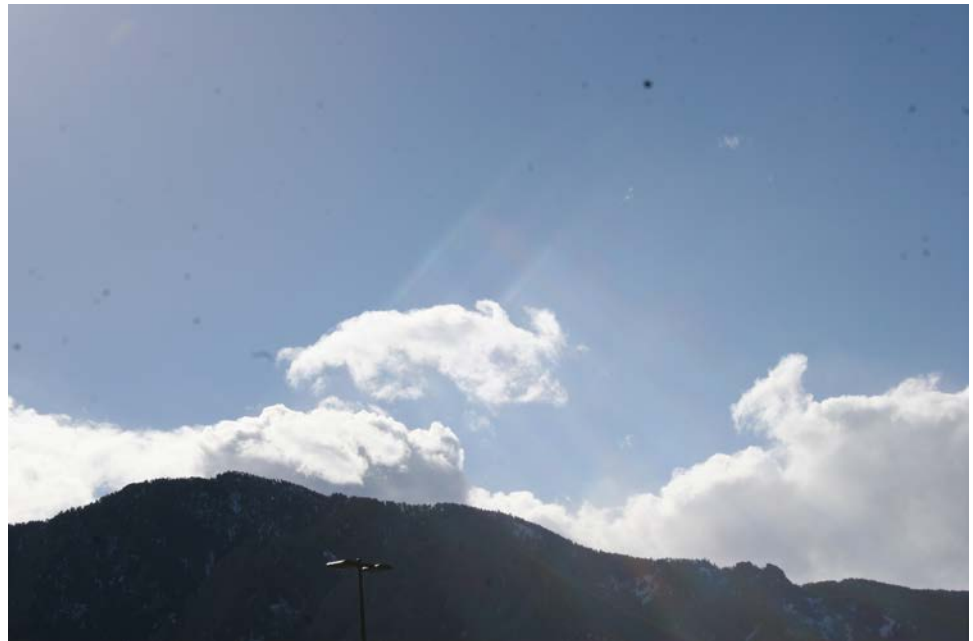
Figure 2: Original Image

Overall, I’m pretty satisfied with how this image turned out. I like how it captures a very neat fluid phenomenon and does it in an interesting way. Also, the presence of crepuscular rays present in the image made it very neat to look at. Lastly, the cloud looks very much like a dragon breathing fire, so that made it even more interesting. In terms of improvement, I think the cloud could have more details shown and more shadows present. However, I like how it turned out in the end.