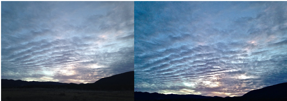
Figure 2. Shows the before (left) and after (right) cloud photo

The cloud image successfully captured undulatus clouds which were then confirmed with the skew-T that they were cirrostratus undulatus clouds. The photo could have been improved by using my Nikon D60, however, I did not bring it on my trip to Vegas. Overall, I was happy that I was able to get a clear view of the sky. The physics are very well shown by the characteristic lines of undulus clouds. The mountains in the background added a cool sense of depth to the photo. I did not find much on information on cirrostratus undulatus clouds but I was actually surprised that the clouds were not altocumulus undulatus due to the thickness that they seemed to have.