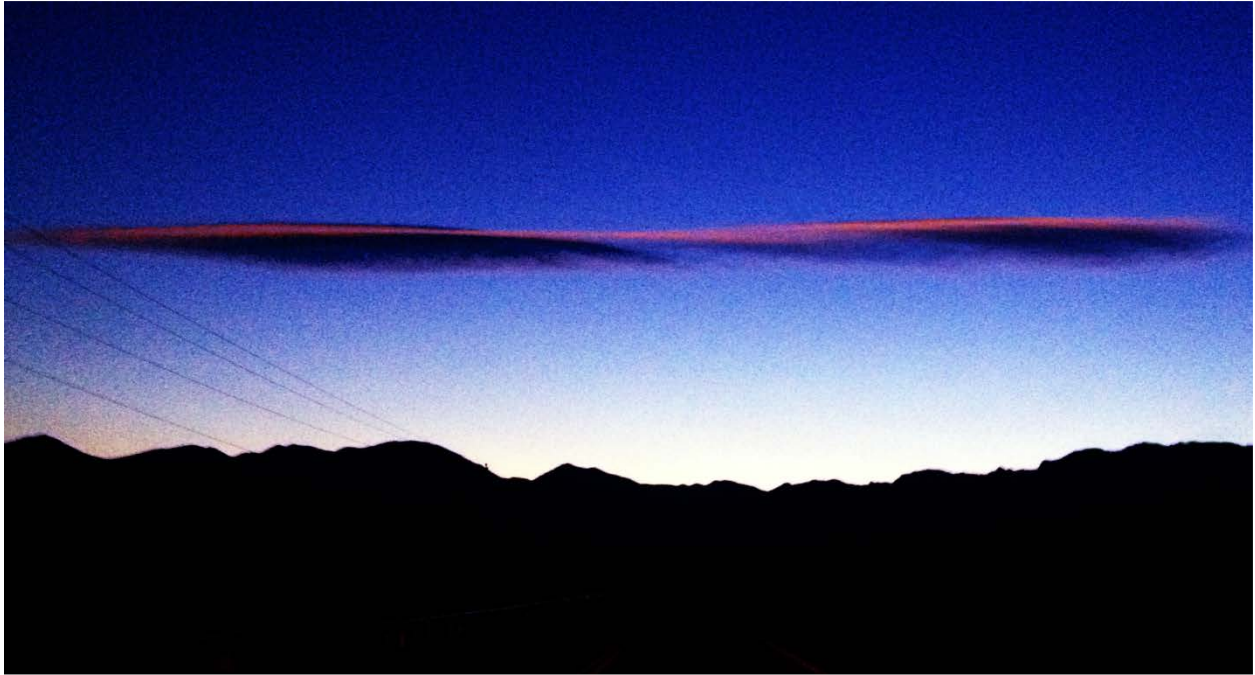
Figure 1: Captured clouds image

The purpose of this cloud assignment was to capture an image of a cloud formation of any type, determine the atmospheric conditions during the image capture, and then characterize the cloud. The particular image of this report attempted to capture the common altocumulus lenticularis often seen over the mountains to the west of Boulder, Colorado. This image also attempted to capture the effect of light refraction due to the atmosphere shortly after sunset. The image was captured on February 26, 2014 at 6 pm MST can be seen in Figure 1.