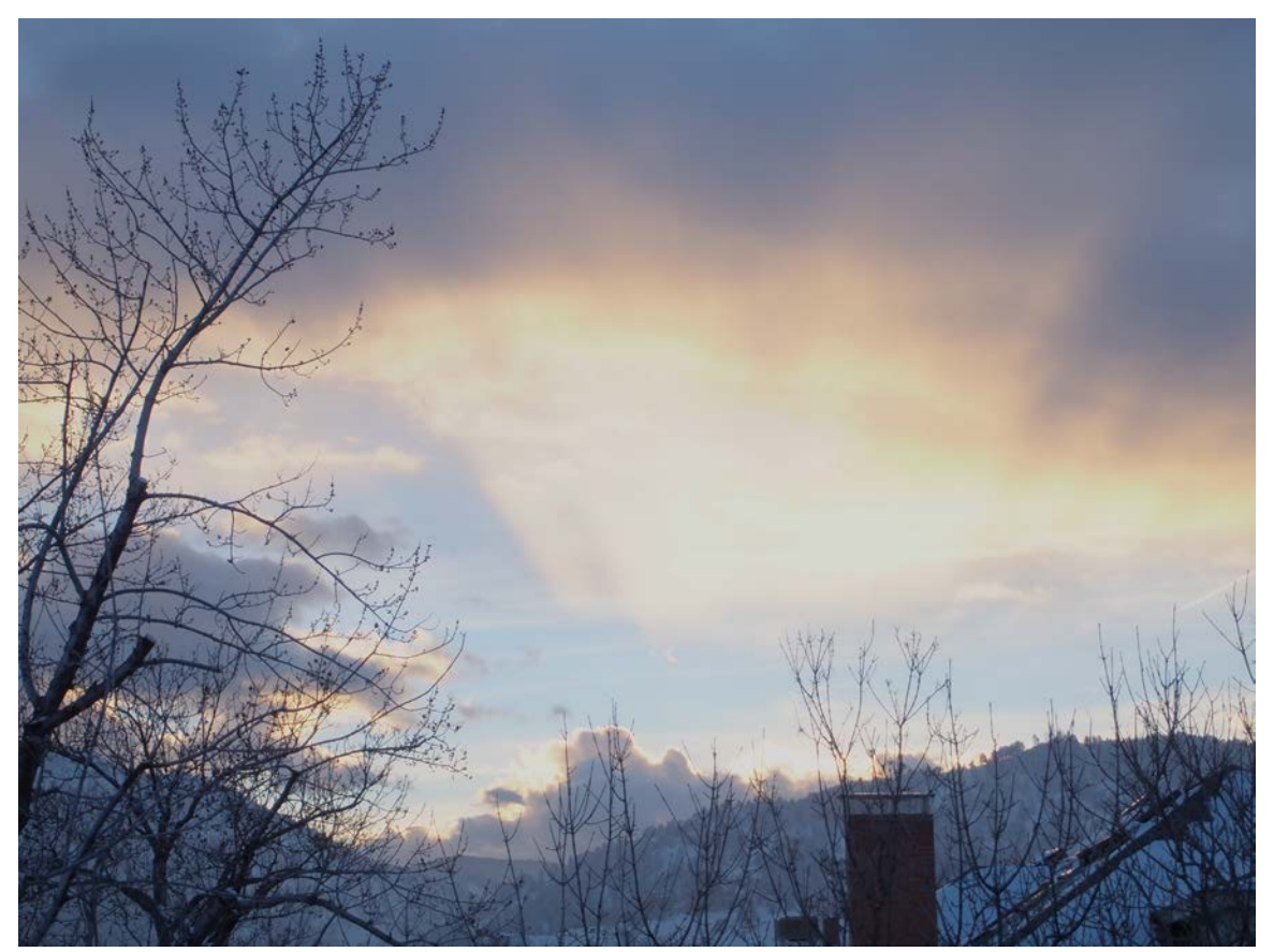
Clouds above Boulder Mountains March 2nd 2014 5:45 PM MST

Logan Mueller Flow Vis Spring 2014 Clouds Assignment #2