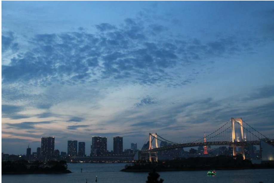
Figure 2: Original Cloud Image