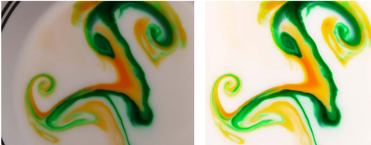
Figure 3: Original photo (left) and post processing photo

In Figure 3 you can see the original picture and then the picture after some post processing. The post processing was conducted in Adobe Photoshop CS5 and primarily increased the brightness, provided some cropping and eliminated the side of the bowl. The post process picture appears a great deal brighter than the original picture at that was done in order to give the picture a more painted feeling.