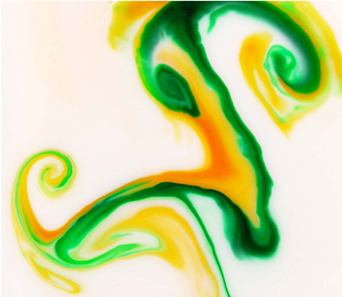
Food Coloring in Milk