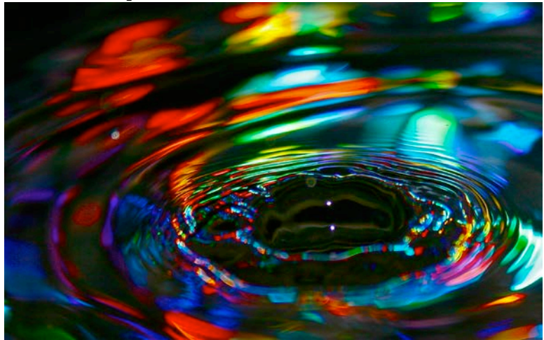
Figure 2: "Crater" phase of a Worthington Jet

In terms of the actual physics taking place in a Worthington Jet, it can be quite complicated. In basic terms, the droplet can be considered to demonstrate the principle of the conservation of momentum. However, instead of a purely elastic collision (like 2 rubber balls colliding), much more energy is absorbed. First, the droplet creates a crater upon impact (shown in Figure 2, another picture I captured). Since the water in the pot does not absorb all of the energy from the original droplet, some of the momentum must be reflected back, which is where the jet comes from. The jet does not return to the original height of the droplet because some energy was dissipated, and because there is now more moving fluid involved in the phenomenon.