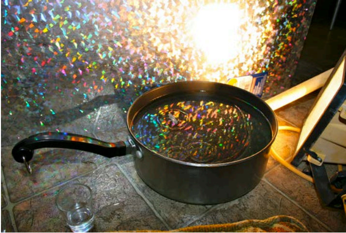
Figure 1: Apparatus to capture water droplet

The purpose of this image was to begin personal exploration into the world of flow visualization, which is the combination of art and fluid dynamics. The intent of this particular image was to display the physics of water droplets (or Worthington jet) in a visually appealing way. I was unsure of which phase of the droplet process I wanted to capture, so I took many pictures to fully describe what was happening. However, in the end I chose to display the “jet” portion of the phenomenon.